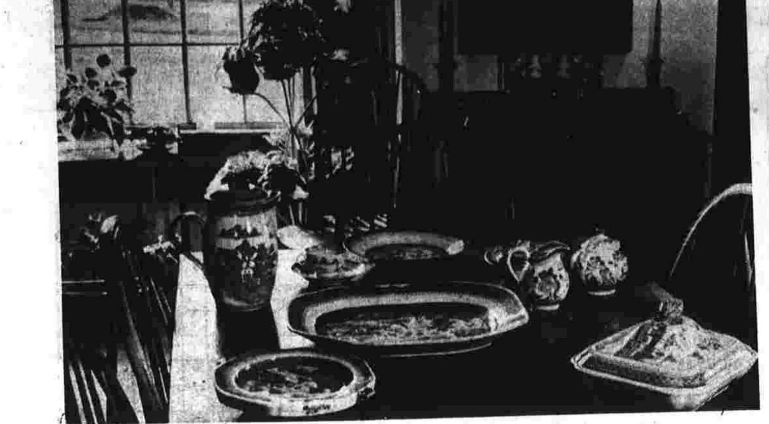
A variety of Canton ware porcelain is displayed on trestle table in family room.