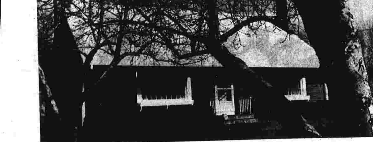
The Bullock's barn red house with white trim is located in former apple orchard.