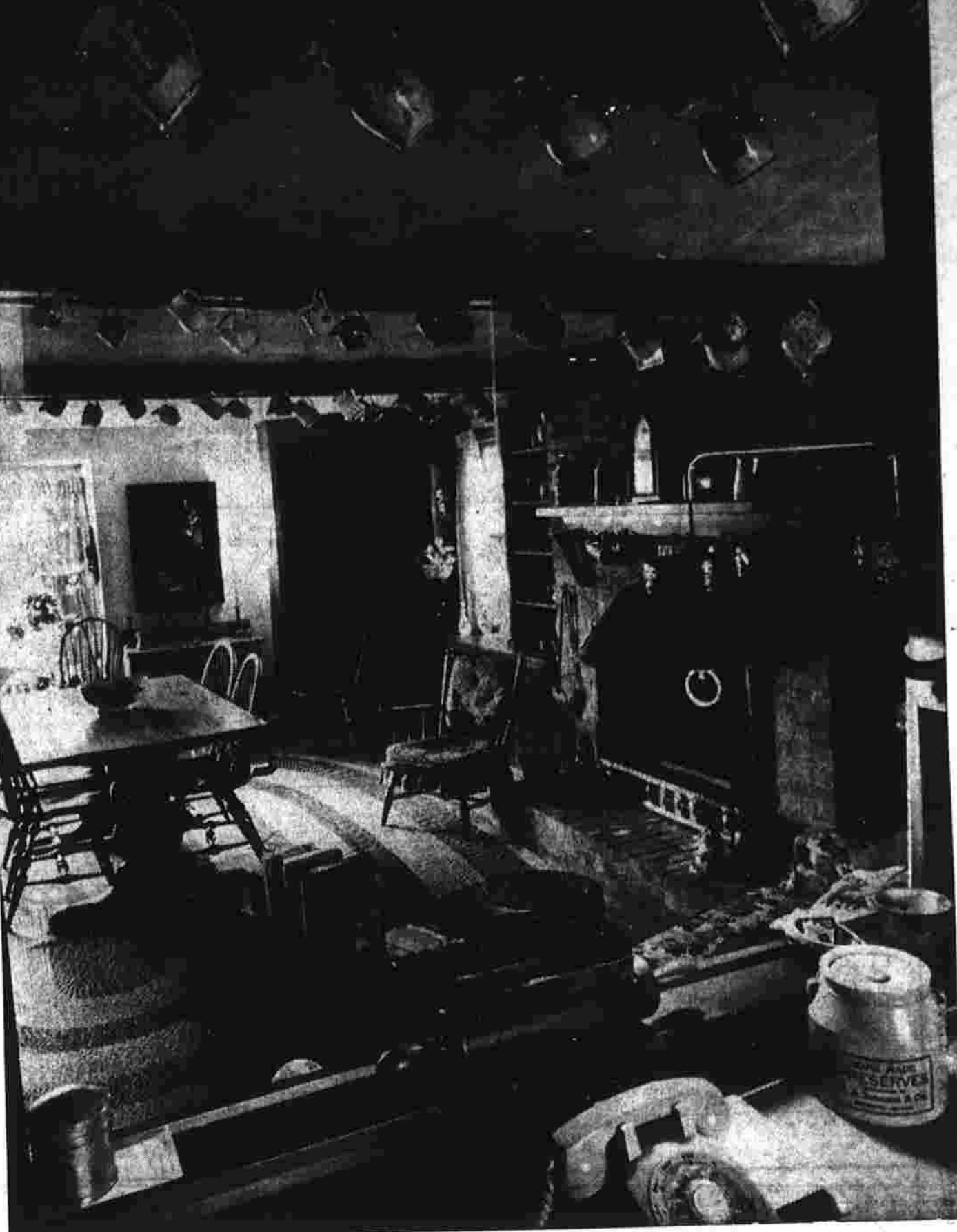
Family room is divided from pullman-type kitchen by waist-high cabinets.