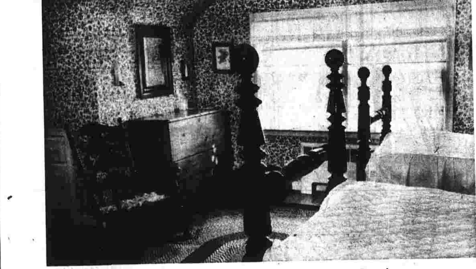
Rocker in upstairs bedroom acquired from Harriet Beecher Stowe home.